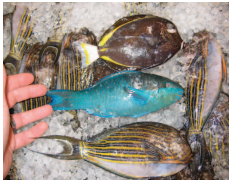
Image 2. Reef fish sold in a local grocery.

A key application intended for the report is to provide guidance in the ongoing development of a network of Marine Protected Areas (MPA) in the Samoan Archipelago. The region is already home to a diversity of MPAs implemented at various levels of government from individual villages and communities to federally protected areas of international significance. Many of the different MPAs in the network were created through independent processes for different objectives but each contributes to the mosaic of marine resource management in the region. Understanding what fish, coral, and habitat resources this diverse network of MPAs collectively encompasses is a key objective of this work and is critical for understanding the scope of current protection and thoughtfully designing additional network elements.